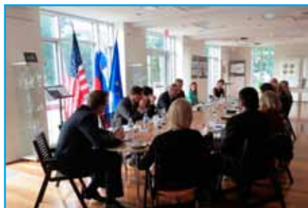
The annual meeting of honorary consuls.