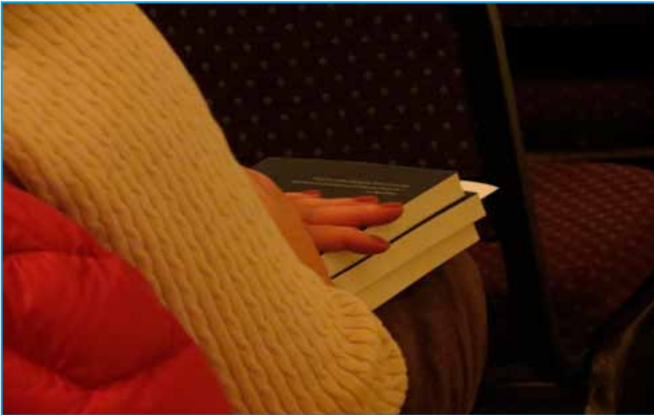
Boris Pahor is best known for his novel "Necropolis" .

2010, showcases the key moments which marked the author's life and present the core of his literary creation. The film was made as a part of a "Sons of Two Nations - Great Men of Slovenia" project, which presents the lives of people who have made an impact in the multi-cultural area between Italy and Slovenia.