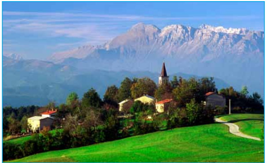
The Banjšice Plateau.

A visitor should take time for a snack at the overlook point or just visit the nearest inn in the hamlet of Lohke. Time permitting, one should climb up to the village of Kal nad Kanalom, where in the quiet solitude, at some distance from the village, stands St. Thomas's church, built in the 15th century. Even higher, lies the village of Lokovec,