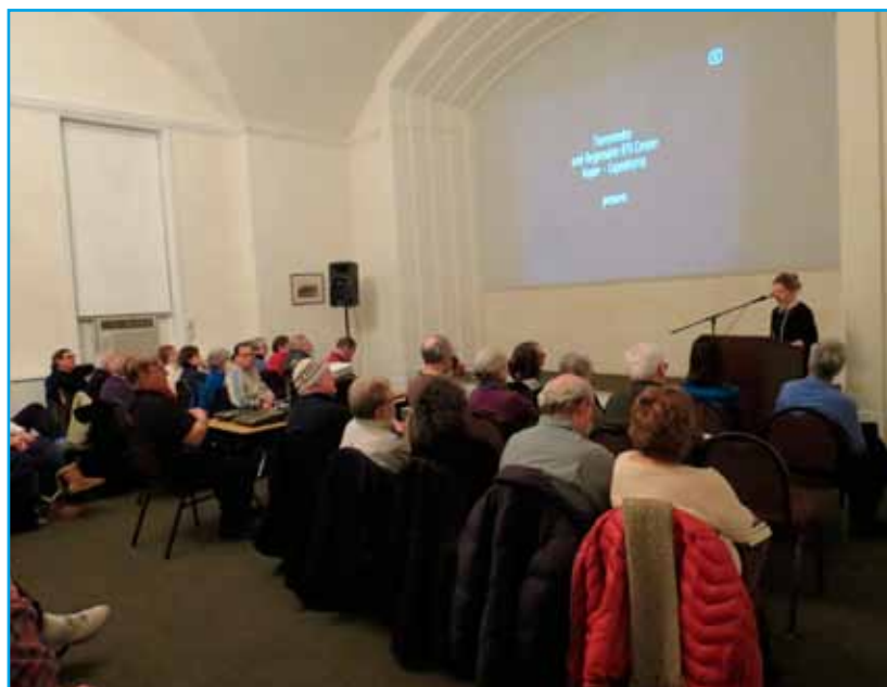
Boris Pahor addressed for the occasion to the American audience a letter, read in both Slovene and English.

Slovenian documentary "The Stubborn Memory" (Trmasti spomin) about a centenarian Slovene writer, holocaust survivor and Nobel literature prize nominee, Boris Pahor, has been presented this week at the seventh annual international film series Bridges to the World, organized by the World Artists Experiences. The series introduces every year free screenings of five international films, this year, one each from Ukraine, Chile, China, Israel and Slovenia.