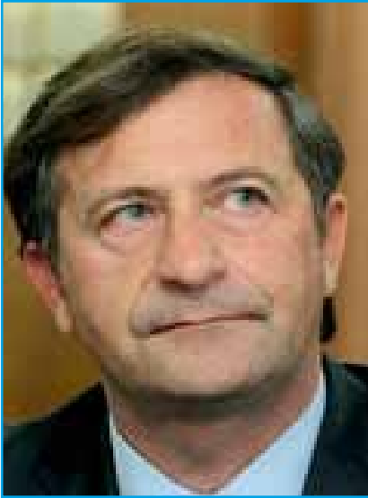
Mr Karl Erjavec, existing Minister of Foreign Affairs continues his work.

Pikalo, Minister of Education, Science and Sport, Dr. Senko Pličanič, Minister of Justice, Mr. Stanko Stepišnik, Minister of Economic Development and Technology, Dr. Gregor Virant, Minister of the Interior and Public Administration, Mr. Dejan Židan, Minister of Agriculture and the Environment, and Ms. Tina Komel, Minister without Portfolio for Relations between the Republic of Slovenia and the Autochthonous Slovenian National Community in Neighbouring Countries and between the Republic of Slovenia and Slovenians Abroad.