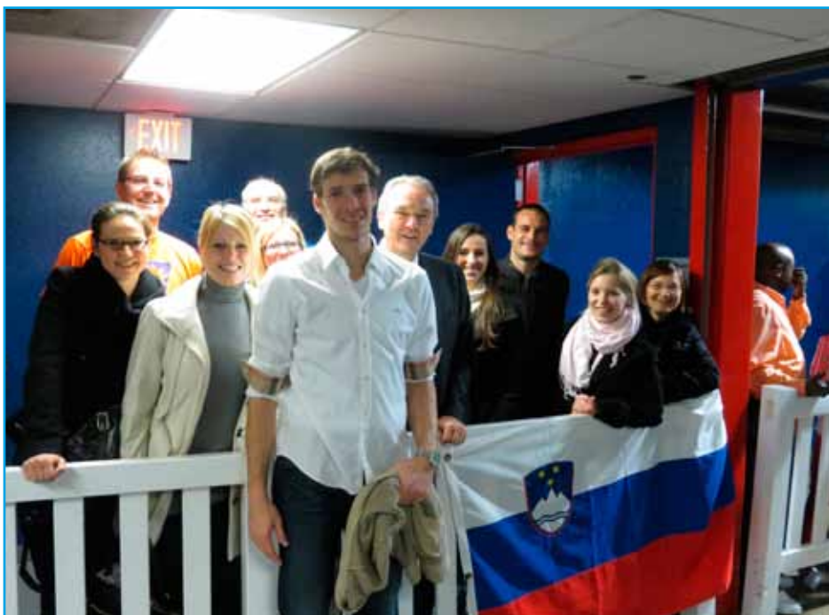
Phoenix Suns' Goran Dragić, of Slovenia, met with the embassy staff after the game in the locker-room of the Verizon Center.

Dragić confirmed he would join Slovenia's roster for the European Basketball Championship, which will take place in Slovenia in September. The Slovenian team is scheduled to gather for training camp on July 19. It is due to play 12 warm-up games ahead of the September 4 opening match in Stožice, Ljubljana.