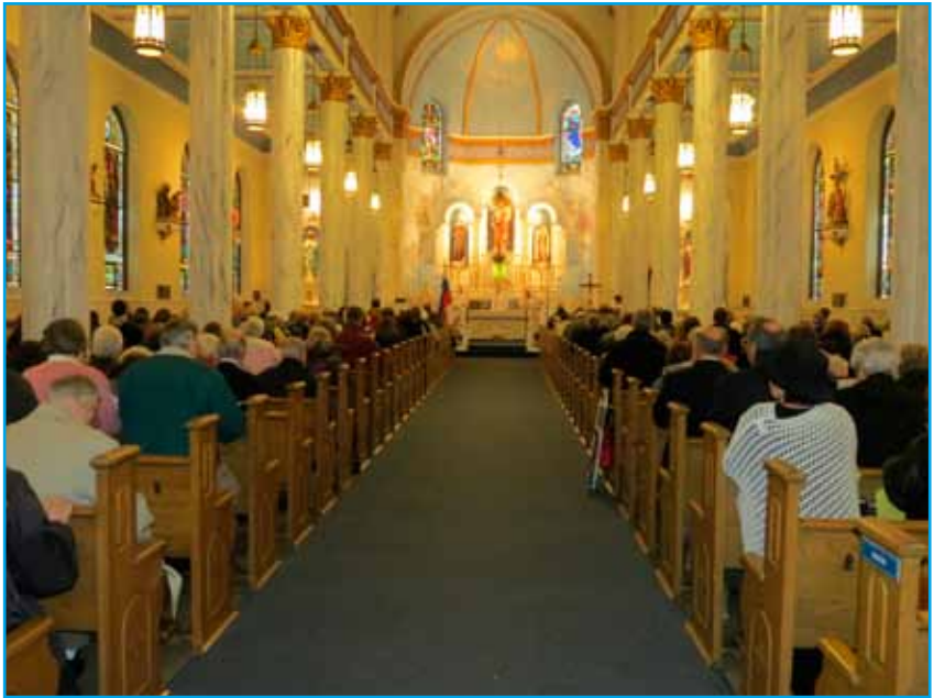
The foundation stone of the church was set 99 years ago.

St. Joseph's parish was founded back in 1913 to serve Slovenian immigrants, most of whom came from the Prekmurje region. The foundation stone was set in 1914 and the church was consecrated, with a Mass in the Slovenian language, in 1917. A strong and vital Slovenian community is trying to have it reopened because of the importance for Slovenes to have a place of worship where they can nurture their heritage.