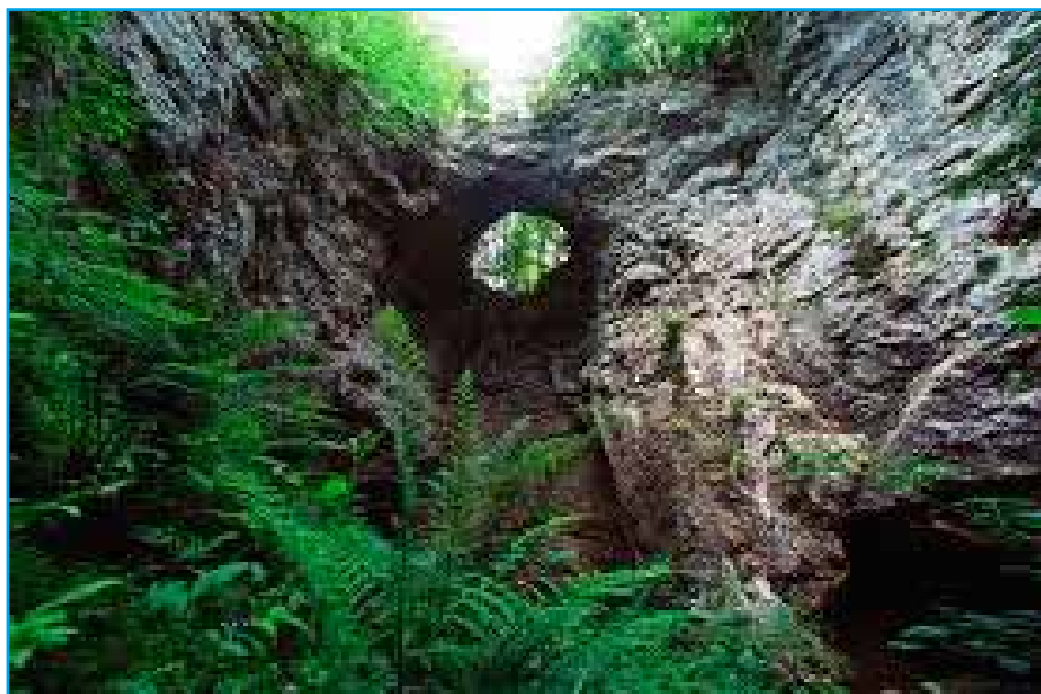
Sunken karst valley of Rakov Škocjan.

By any means the most famous sight of the area is the intermittent Lake Cerknica: when full, it covers 24 sq. km. (9.3 sq. mi.) and is thus the largest lake in the country. Yet, in 1686 Janez Vajkard Valvasor, a nobleman, scientist and polymath, and a fellow of the Royal Society in London, noted: "Without any false modesty, I can state that the story of Lake Cerknica is a true wonder of nature, and that it ranks, rightfully and without any bias, among the greatest wonders of the natural world."