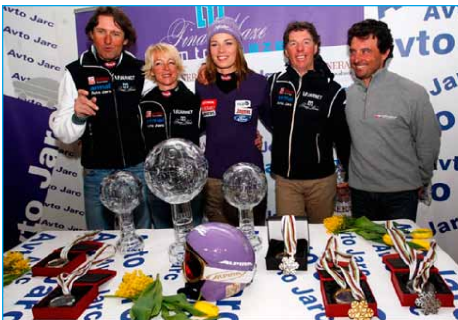
Tina and her team to A-MAZE.

The president of the International Skiing Association, Gianfranco Kasper, hailed Maze as the definitive queen of this season. Maze was also honored by the Slovenian government, stating that she has promoted Slovenia "above all expectations," particularly by drawing attention to its tourism and economy.