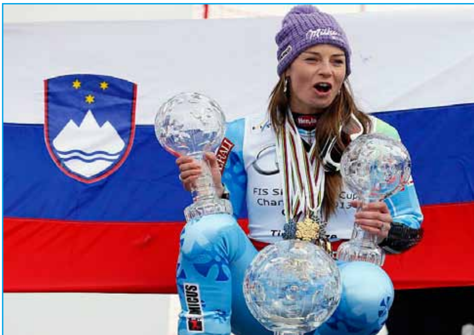
Tina with her three crystal globes.

Her amazing achievements place Tina Maze among the best alpine skiers in history and best athletes in Slovenia. Maze cruised to her 22nd podium finish three weeks ago to match the record of Austrian skiing champion Hermann Maier, who managed the same feat in the 1999/2000 season. Maze won 11 races this season, which puts her third in the history of women's alpine skiing, coming only behind