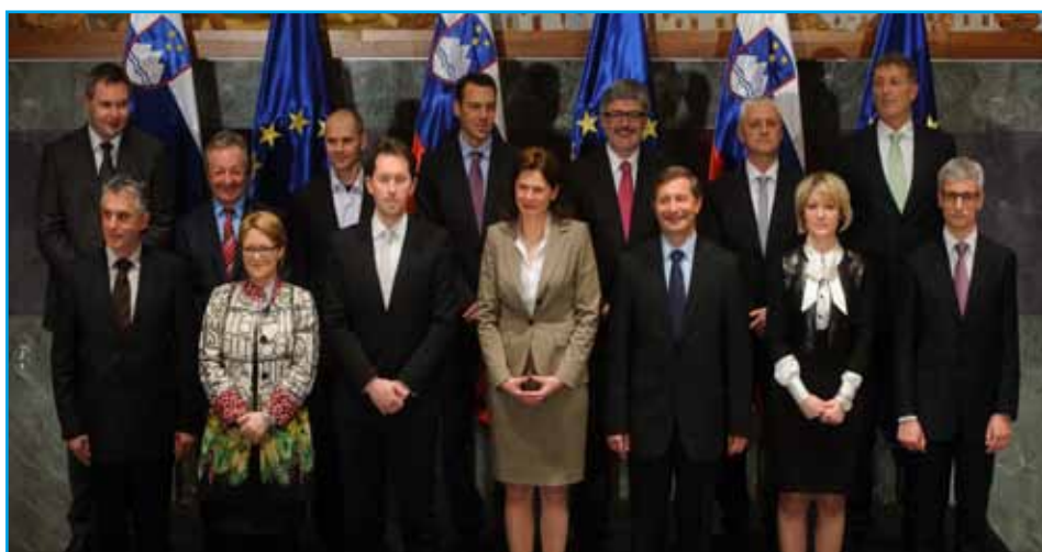
Slovenia's new government was sworn in on Wednesday, March 20 evening.

Together, the newly formed coalition controls 49 seats in the 90-seat National Assembly, while Wednesday's vote also saw endorsements by two of the three unaffiliated MPs and one minority MP. The