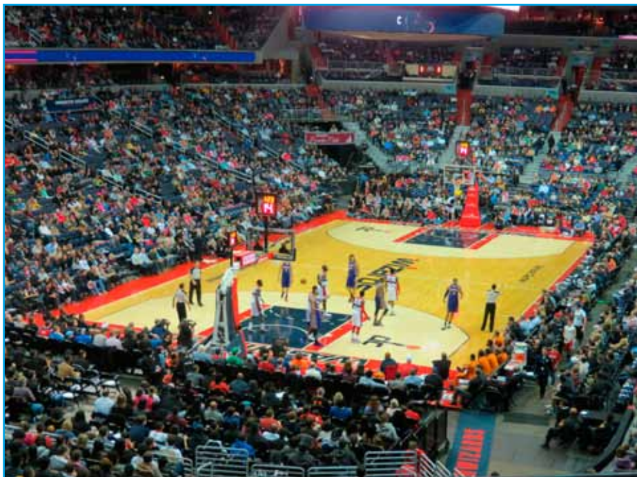
Phoenix Suns' point guard, Goran Dragić (1) drives to the basket as Washington Wizards forward Martell Webster (9) and guard John Wall (2) defend during the second half at the Verizon Center.

Goran Dragić began his professional career at the age of 17 in 2003 with Ilirija Ljubljana. In 2007, he joined the Slovenian League, Adriatic