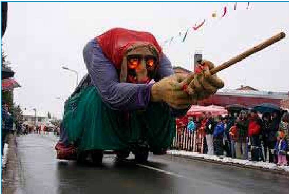
Cerknica is famous for its traditional carnival that always features a witch from Mount Slivnica.

In the summer and late winter, when the lake is usually dry, picturesque karst features can be seen on its dry bed, including vertical sinkholes, estavelles, cave sinkholes, and surface water flows. The main watercourse in the lake area is the Stržen River. In the autumn, when the rainfall is light, the lake is completely drained into caves below the ground and its bed is quickly covered by rich vegetation. With the return of heavier rains, the surrounding higher lying caves are