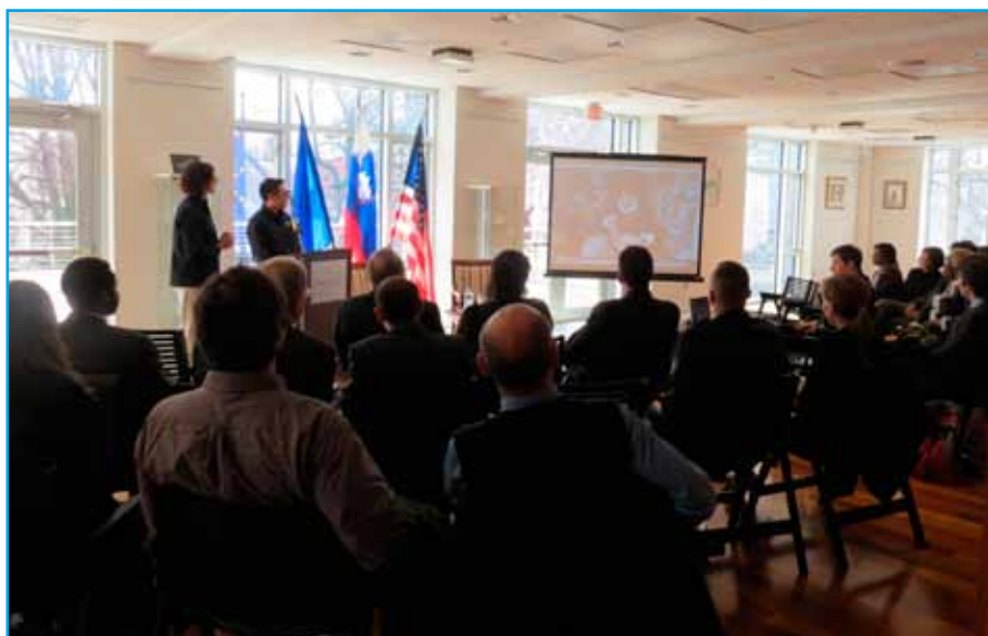
Astronauts shared their experience about their last expedition in space.