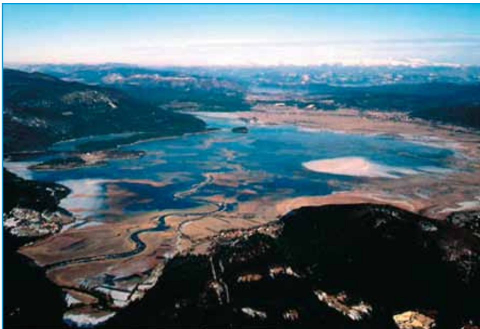
Intermittent Lake Cerknica.

Cerknica, a town in the Karst region of southwestern Slovenia, is located on the southern border of Cerknica polje around the river Cerknjščica. The original settlement was probably located on the present Uševak polje. From there, it was supposedly moved to the hill around the church, where is the present old town core, called Tabor. Cerknica's name, containing the root word "cerkev" (church), allegedly originated there. At Gradišče, there are the remains of prehistoric walls, testifying to an early settlement, and, on Sinja gorica, a Roman burial site.