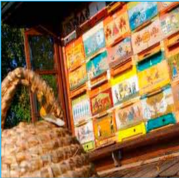
The region is also known for its beekeeping tradition. ( www.slovenia.info )