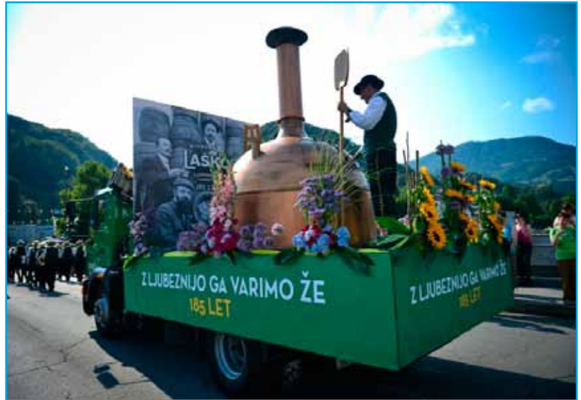
The annual event "Pivo in cvetje" took place between July 11 and 14.

nearby Rimske terme reaches back centuries. The Laško spa springs were frequented by Roman legionaries and in the Middle Ages by Christian missionaries, and at the end of the 19th century became a popular summer resort, regularly visited by the Austro-Hungarian emperor Franz Joseph I.