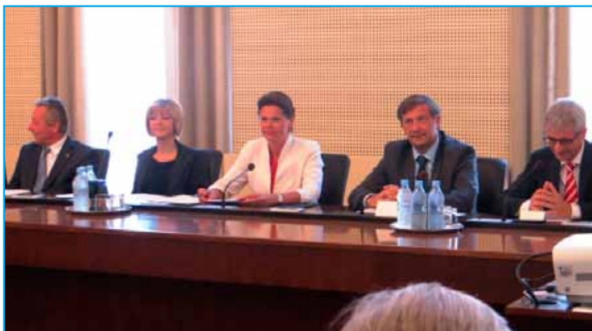
Prime Minister Alenka Bratušek and Minister for Slovenians abroad Tina Komel were joined by Ministers Erjavec, Stepišnik, Pikalo and Židan.

The Council discussed the challenges faced by the young generations and called for greater participation of Slovenians around the world in economic cooperation with the homeland. The next important step is to upgrade policies and strategies that would provide solutions for new challenges in the fields of culture, language, science, economy, sports, intergenerational cooperation as well as youth and cross-border cooperation.