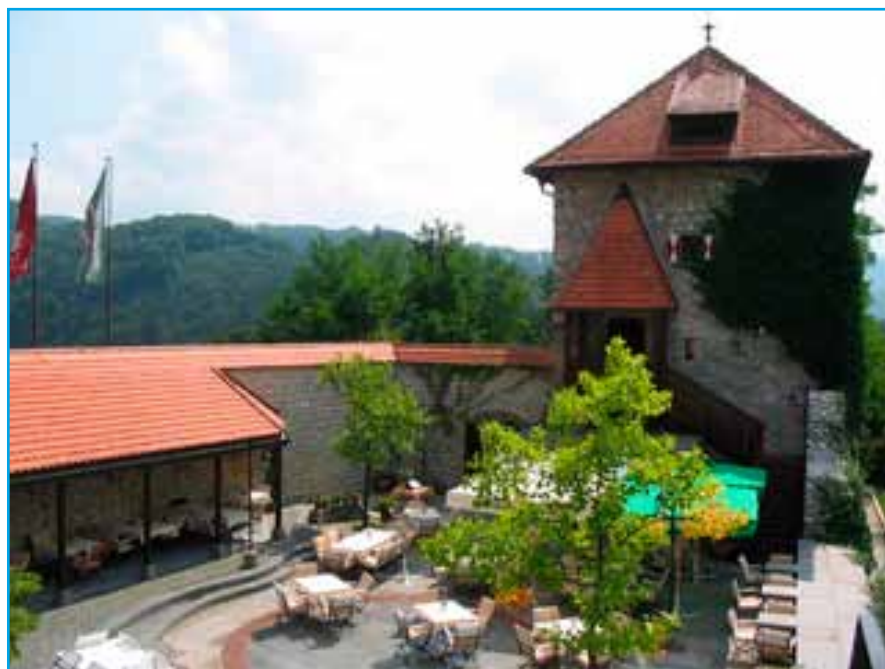
Tabor Castle dates to the 12th century.

The tradition of seeking health in the thermal waters in Laško and in the area of the