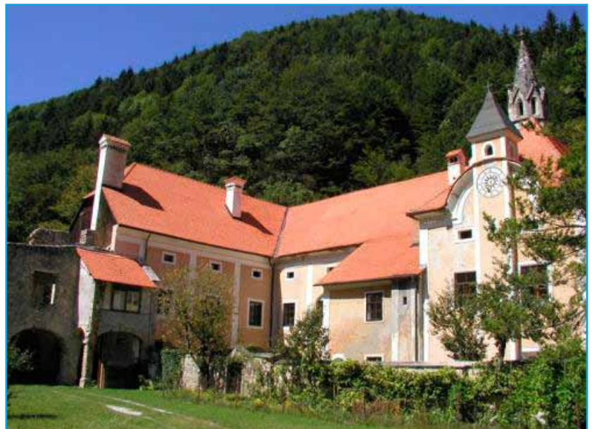
Monastery of chartusian monks in Jurklošter.