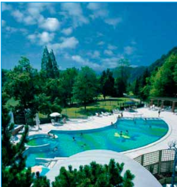
Thermana Laško.

entertainment in Laško, when the whole town turns for a few days into amusement grounds with performances by top musicians and entertainers. The magnificent fireworks, along with the traditional country wedding and the parade of beer, flowers and traditional customs, are both the traditional fixture and the main attraction of the festival, which this year took place between July 11 and 14. More information is available at: http://www.stik-lasko.si