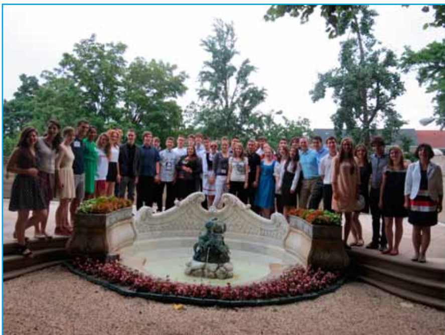
YLPCE brought together 46 youth leaders and adult mentors from Hungary, Serbia, Slovakia, Slovenia, and the United States.

The U.S. Department of State's Youth Leadership Program with Central Europe (YLPCE), implemented by the Meridian International Center in cooperation with Central European partners, this summer for the third time brought together 46 youth leaders and adult mentors from Hungary, Serbia, Slovakia, Slovenia, and the United States to build cultural bridges and work together to enhance their leadership skills and