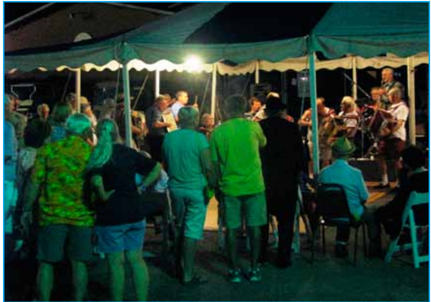
This year, the festival featured more than 20 Slovenian polka bands and button box accordion clubs at five indoor and outdoor venues.

The program also included the 57th anniversary of the Miss SNPJ Pageant, which has become a highlight of each Slovenefest since 1998. The event was