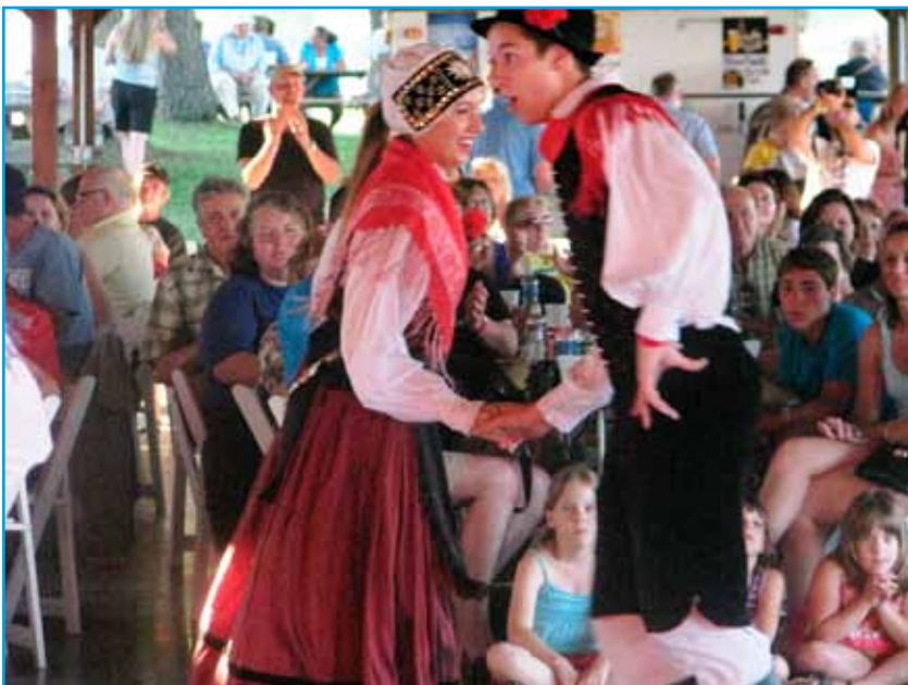
The festival was attended by several thousand people from all over the U.S. and Canada.

The SNPJ, a fraternal benefit society, was formed in 1904 by Slovenian immigrants to provide affordable life insurance to the new Slovenian-Americans and to preserve the Slovenian culture. For more information about Slovenefest, visit www.snpj.org/Slovenian-Culture/Slovenefest