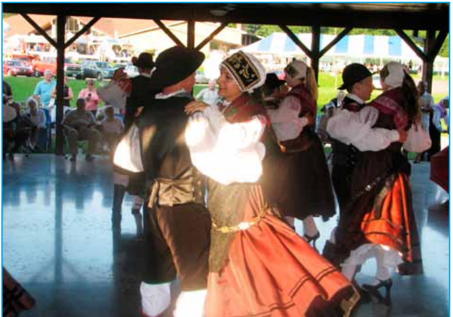
Performance by Mladi glas and Planika Dance Group.

The Slovene National Benefit Society (SNPJ) organized on July 12-14, 2013, its 32nd annual Slovenefest, which took place at the SNPJ Recreation Center in the Ennon Valey City, Pennsylvania. Slovenefest is the largest Slovenian cultural festival in North America and every year attracts thousands of participants from several states. This year, it featured more than 20 Slovenian polka bands and button box accordion clubs at five indoor and outdoor venues, which offered a perfect opportunity for learning